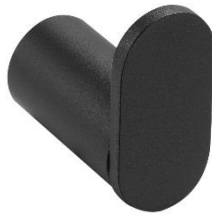
AI1318B Black finish