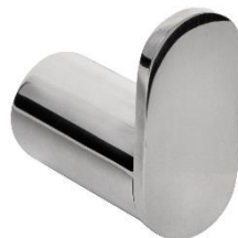
AI1318C Bright finish