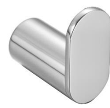
AI1318CS Satin finish