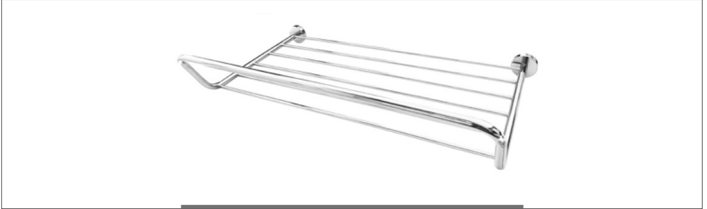
Accessori - Complementi - AMAV21