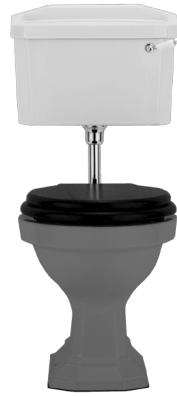
Sanitari e Consolle-London PHLO11