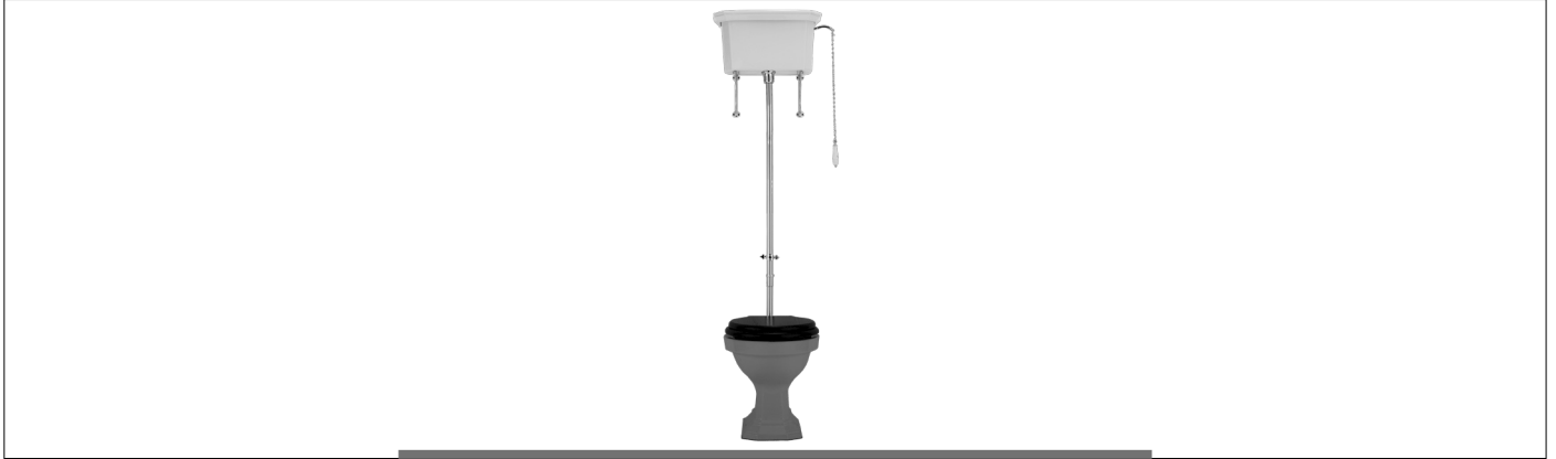
Sanitari e Consolle-London PHLO12