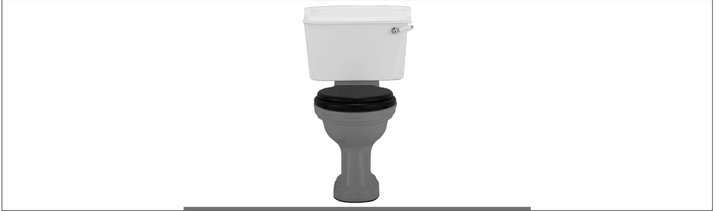
Sanitari e Consolle-Oxford PHOX10