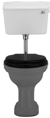
Sanitari e Consolle-Oxford PHOX11