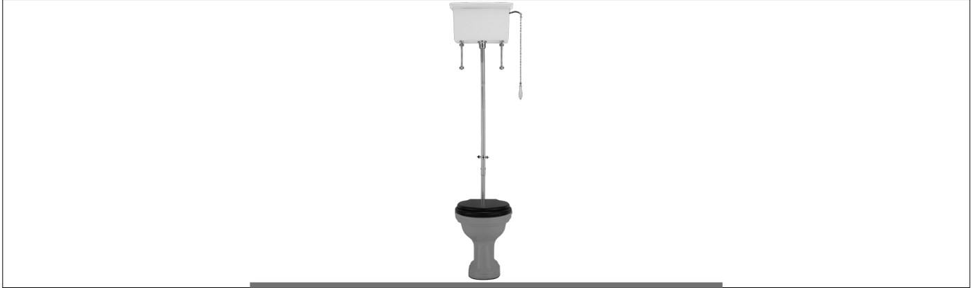
Sanitari e Consolle-Oxford PHOX12