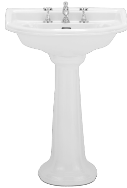
Sanitari e Consolle-Oxford PHOX05