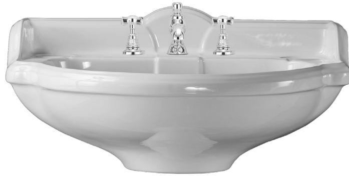
Sanitari e Consolle-Pompei PHPM05