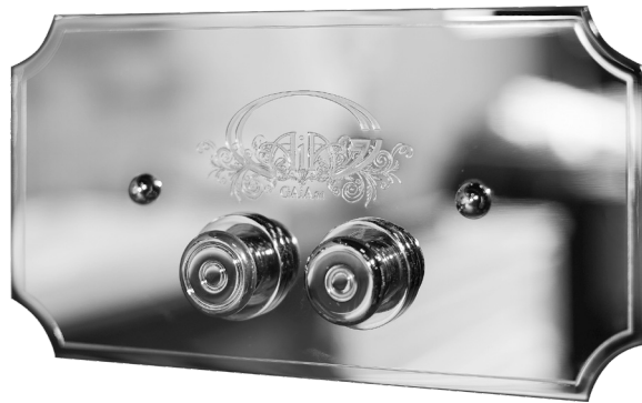
Sanitari e Consolle-Complementi Sanitari PSAC01