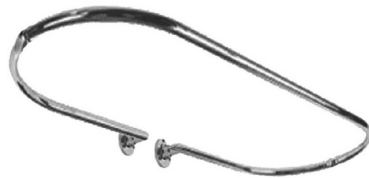
Accessori - Accessori Vari - VMPT115