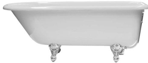
Vasche - Roll Top 170 - VRG1900